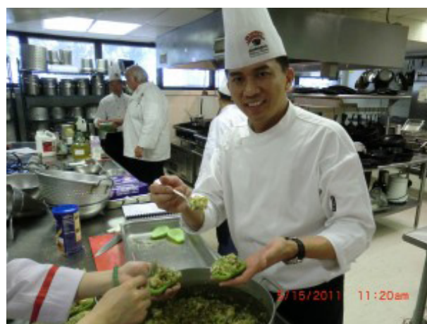
Getting the shrimp stuffed mirlitons ready for lunch

The afternoon session was a continuation of the morning's session but still a little different in that the dishes prepared for session II were all tomato/roux based dishes. All of afternoon dishes start out with a roux (dark to light roux), and utilize the ingredients of the trinity (onions, celery, and peppers), tomatoes, and products indigenous to Louisiana.