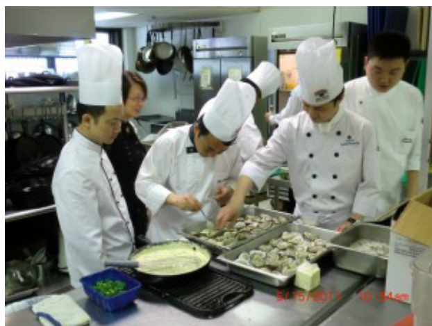
Adding the stuffing for the Oysters Bienville.