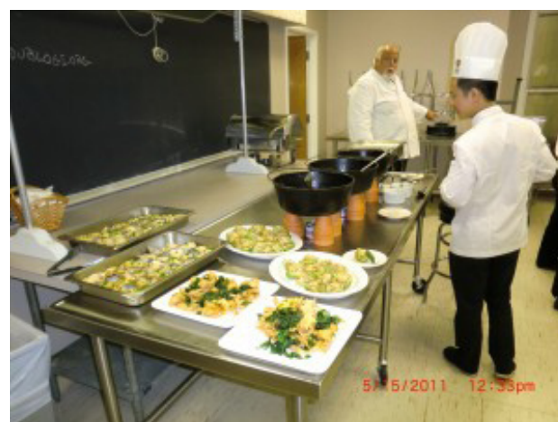
Lunch is ready!