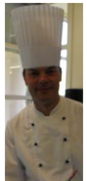
Jura (Haaga Helia)